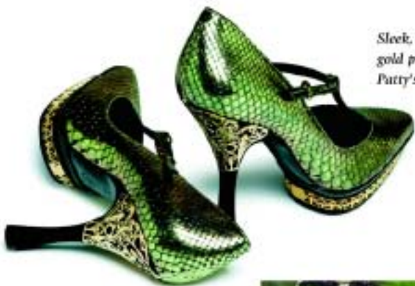
Sleek, black & gold python Putty's by Bally.