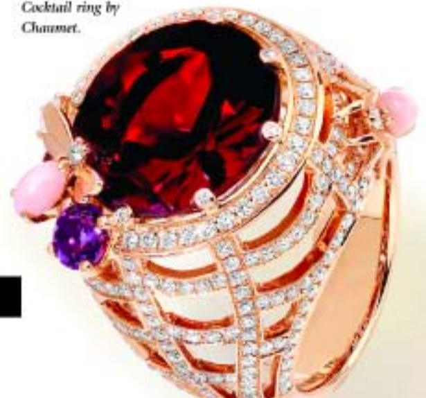
Cocktail ring by Chaumet.

Bond Noël sees the famous street transformed into a magical winter scene with snow falling the entire length of the street, settling on clusters of fir trees watched by a group of