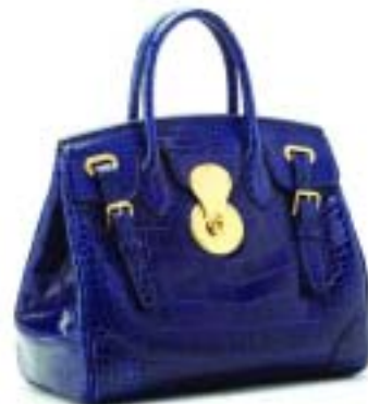
Traditional yet sleek the exquisite Rickshaw Bag by Ralph Lauren.