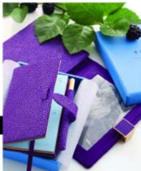
The usifer diary and travel frame from Smythson. This new Iris collection with its stingray print leather and subtle shimmer evoke a 1930's elegance.

N o other street in the world can sparkle and glisten like Bond Street, home to the world's most exquisite jewellers and watchmakers, the finest art and antique galleries and the most sought after designer fashion and accessories.