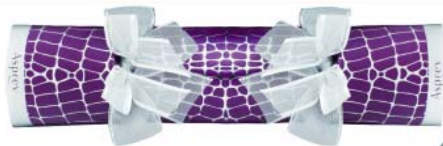
The Asprey Cracker - a classic feature of the traditional British Christmas.

There is also a chance to bid for the ultimate VIP experience on Bond Street and raise money for The Louis Dundas Centre for Children's Palliative Care at www.gosh.org/bond