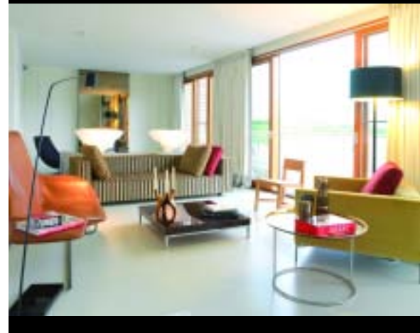
Top of page: getting away from it all at The Lakes. Above: the living room at Jade. Right: living on the water.